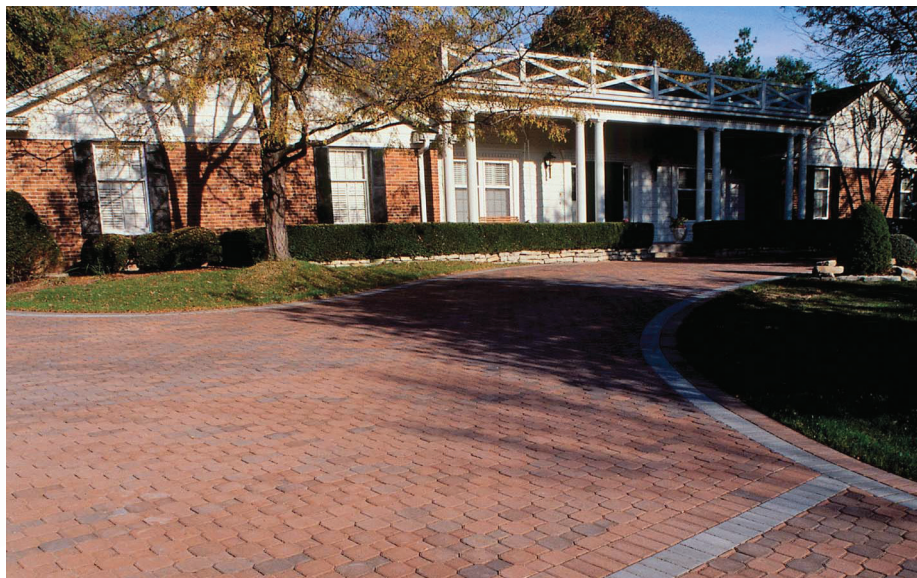
Decoro™ combines two distinct shapes in one paver for a timeless pattern.

For a simple paver with an attractive, easily-installed pattern choose Decoro™. The two different but compatible shapes that make up the Decoro™ paver style allow for a pleasing pattern with absolute simplicity of installation. For a diamond-like pattern try installing Decoro™ at a 45° angle to the edge of your installation.